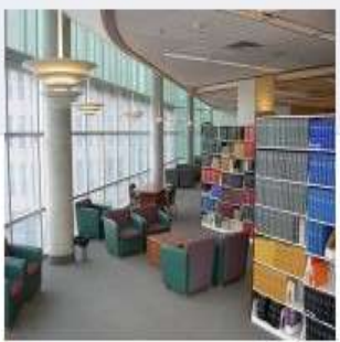
Manitoba's Health Information Place.

Sign Up University of Manitoba Health Sciences Libraries is on Facebook Sign up for Facebook to connect with University of Manitoba Health Sciences Libraries.